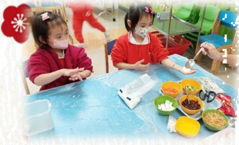
Making Sweet Dumpling