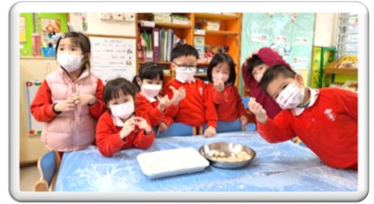
Making Sweet Dumpling