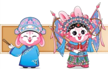
Chinese opera masks