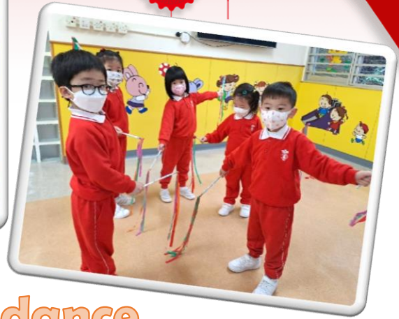
Chinese traditional dance