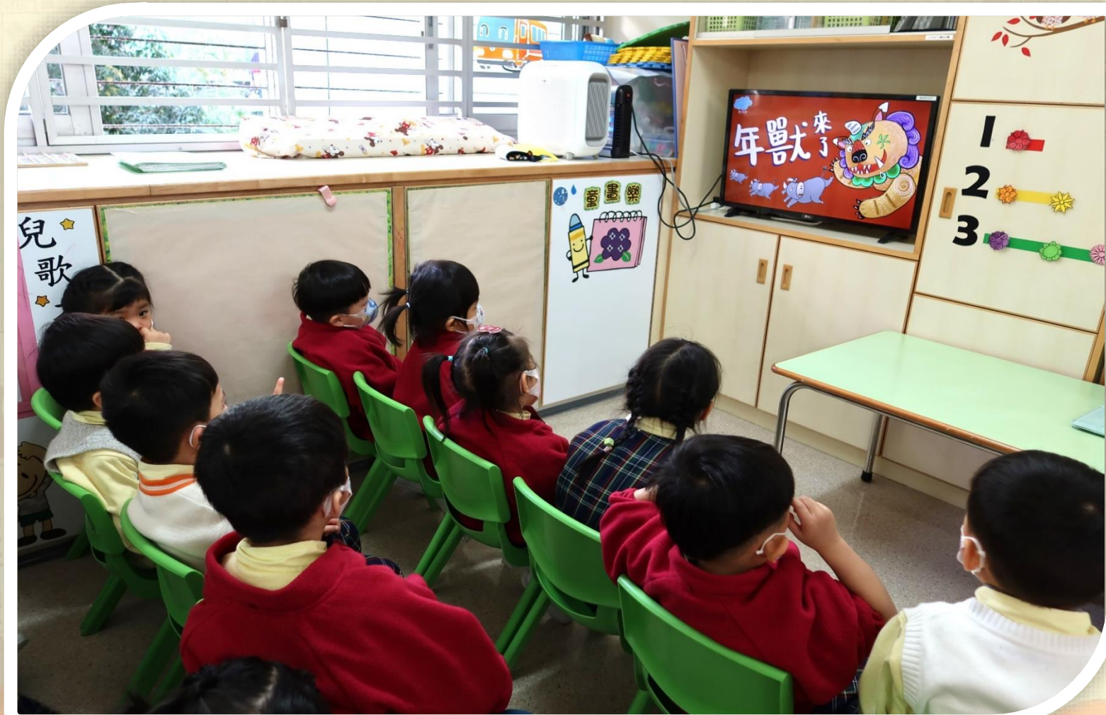
Story - 《年獸來了》